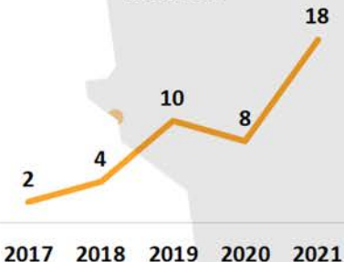
Total number of reported incidents