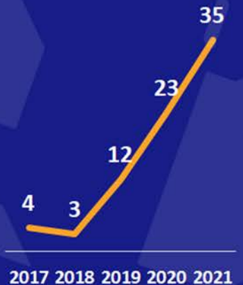
Total number of reported incidents

Over 50% increase in reported incidents compared to 2020.